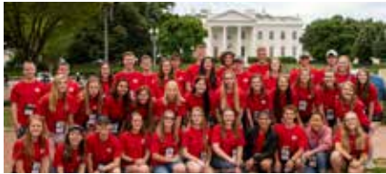
During the Electric Cooperative Youth Tour to Washington, D.C., students meet with elected officials. This year's tour will be June 18-25, 2020.

Ninnescah Electric will select two students to take an all-expenses-paid trip in the summer of 2020. If you are a high school sophomore or junior, submit your application for the chance to win one of these trips.