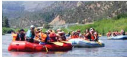
Each year, campers go rafting during Cooperative Youth Leadership Camp in Steamboat Springs, Colorado, which is scheduled for July 10-16, 2020.

Imagine — a chance to visit our nation's capital for one week, meet with more than 1,800 students from across the U.S. and visit with Kansas' senators and congressional representatives. Ninnescah will choose one winner to go to the Electric Cooperative Youth Tour in Washington, D.C., from June 18-25, 2020. The week-long trip to Washington, D.C., is jam-packed with sightseeing. Students will visit many of the major monuments and memorials, including the Lincoln Memorial, the Jefferson